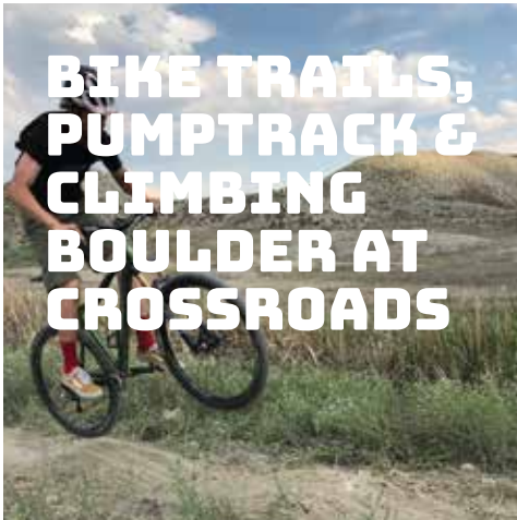
BIKE TRAILS, PUMPTRACK & CLIMBING BOULDER AT CROSSROADS