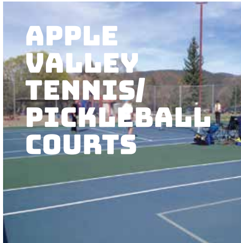
APPLE VALLEY TENNIS/ PICKLEBALL COURTS