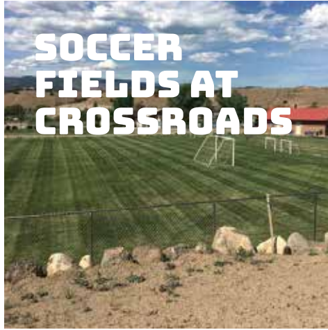
SOCCER FIELDS AT CROSSROADS