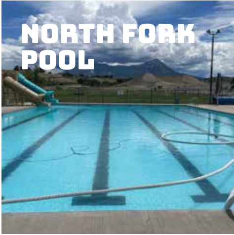
NORTH FORK POOL