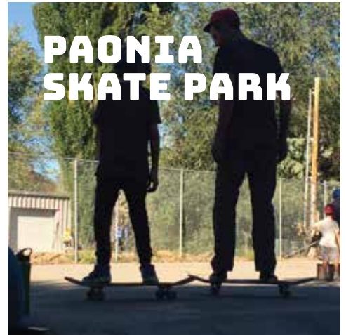
PAONIA SKATE PARK