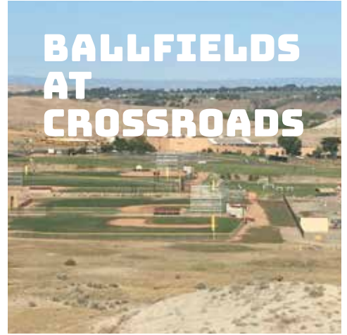
BALLFIELDS AT CROSSROADS